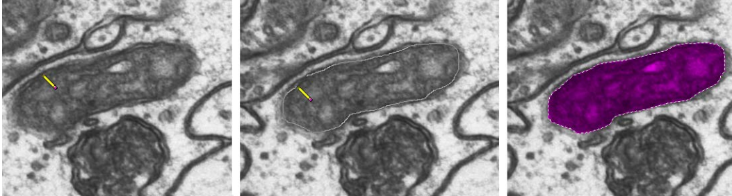
Figure 1.4. Drawing a trace with the freehand drawing tool. ( left ) Start of the tracing. The pencil is positioned at the profile to be traced and the left mouse button pressed and held down. ( middle ) Just before release of the mouse button. The pencil left a trail where it was moved with the mouse from the start position. ( right ) Right after release of the mouse button. The trace is closed and filled with color.

Down or by selecting the first section in the list generated from the List item of the Section menu.